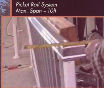
Picket Rail System Max. Span – 10ft