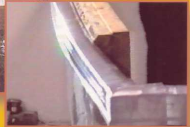
Tempered Glass System Max. Span – 5ft.